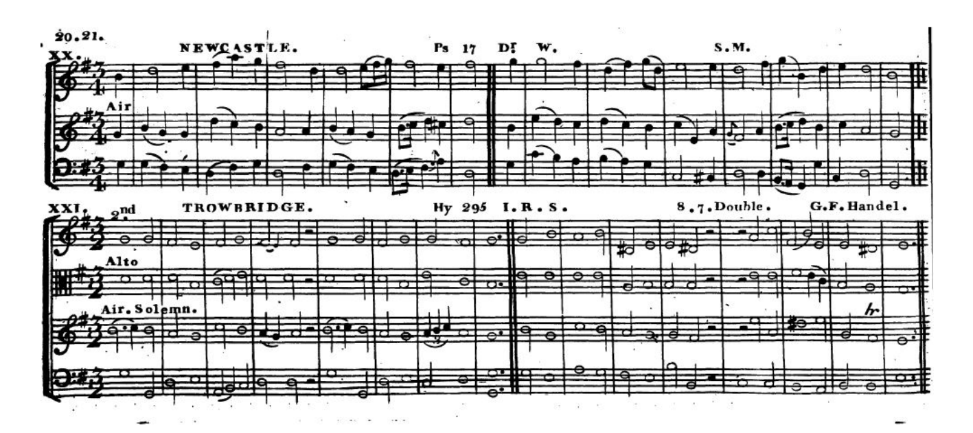
Page 20 and 21 from Rippon's Selection of Psalm and Hymn Tunes..., 1790.

Rippon's Selection of Psalm and Hymn Tunes..., 1790